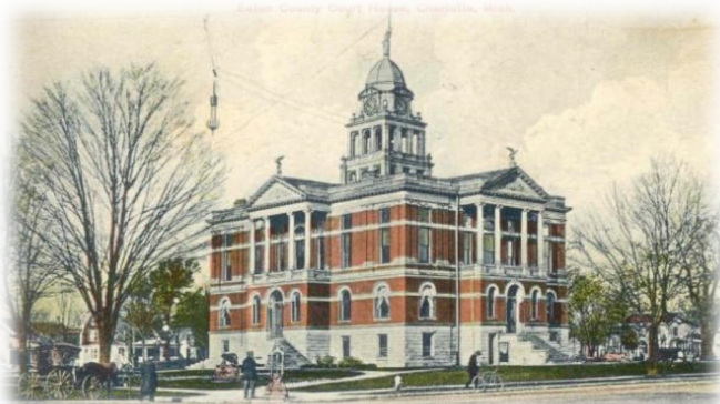
Keeping History Alive on The Square!

Courthouse Square Association is open Tuesday, Wednesday, Thursday & Saturday from 9:00 am to 4:00 pm. Other times can be arranged for special events and by appointment.