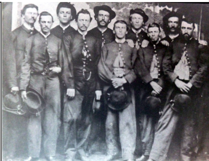
Charlotte soldiers in the Second Michigan Volunteer Cavalry Regiment — 1864