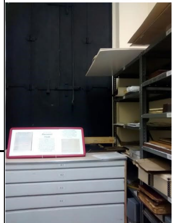
The Museum Collection Vaults will be open for tours during Celebrate Charlotte