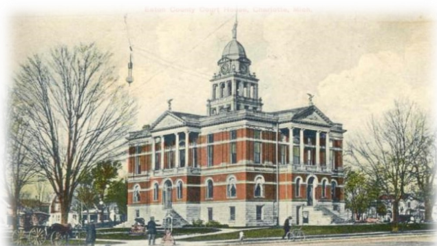
Keeping History Alive on The Square!

Courthouse Square Association is open Tuesday, Wednesday, Thursday & Saturday from 9:00 am to 4:00 pm. Other times can be arranged for special events and by appointment.